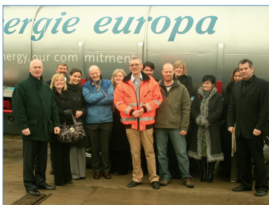
NIABT visits the Biogas plant

Following a successful visit to Brussels in April 2009, the NIABT launched its European Education Programme in February 2010, hosted by the Leuven Institute for Ireland in Europe. This was an invaluable opportunity for businesses and MLAs to learn about European Institutions and see first-hand the relevance that the European Parliament has to local issues and the importance of having representation in Brussels. In addition to a series of lectures and presentations in both Leuven and Brussel, the group visited the Northern Irish MEPs as well as Enterprise Ireland where the group received a presentation on the Framework 7 Programme.