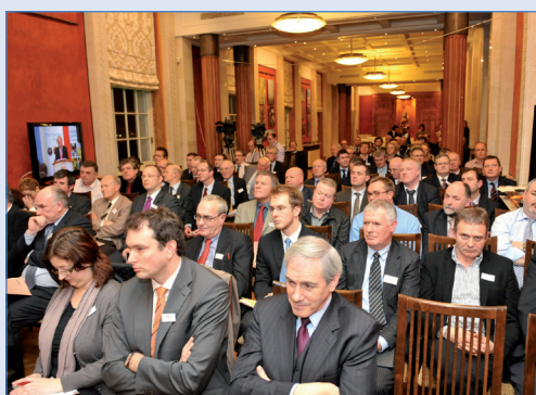
Business People and MLAs at Panel Event