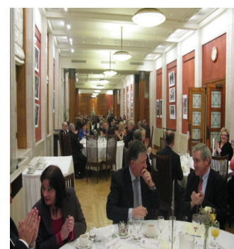
Parliamentarians and the business sector discuss skills, training and em- ployment.